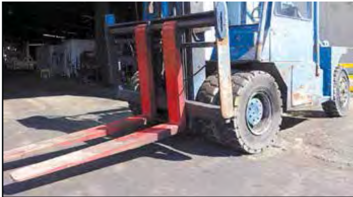
Taylor 52,000-Lb. Forklift Truck