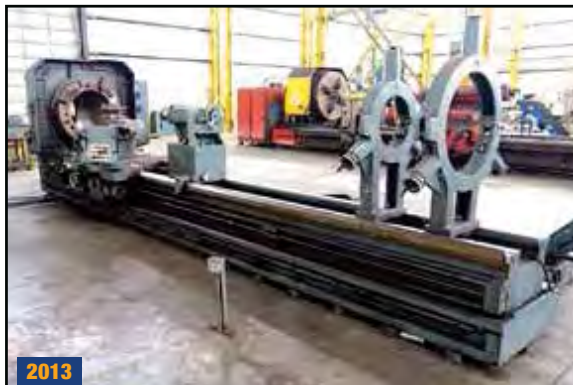
Vantage 60" x 240" Heavy-Duty Lathe

Partial Listing Only, Visit Our Website www.hilcoind.com/sale/Forge-USA-Machine-Shop