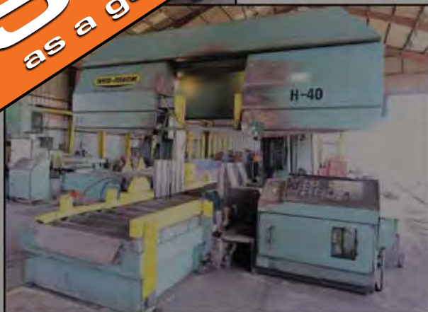
HOUSTON, TEXAS, USA