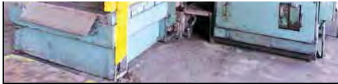
Hyd-Mech 41" x 41" Horizontal Band Saw