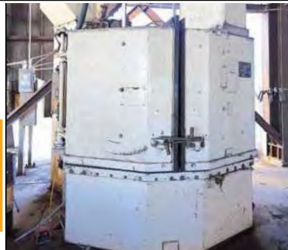
Pangborn 6LK4 Shot Blast

The Auction Will Be Conducted Onsite & Online