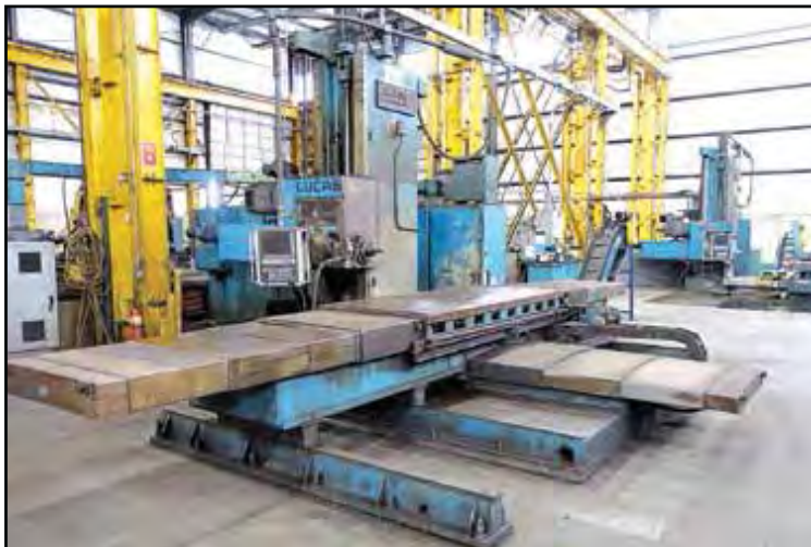
Lucas 5" CNC Horizontal Boring Mills