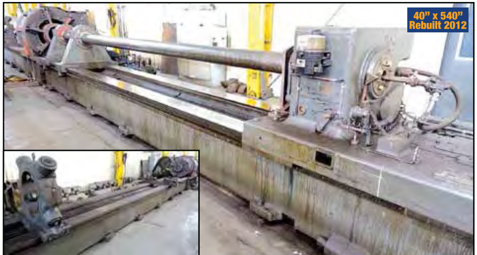
LeBlond 40" x 540" Hollow Spindle Push-Pull Boring Machine