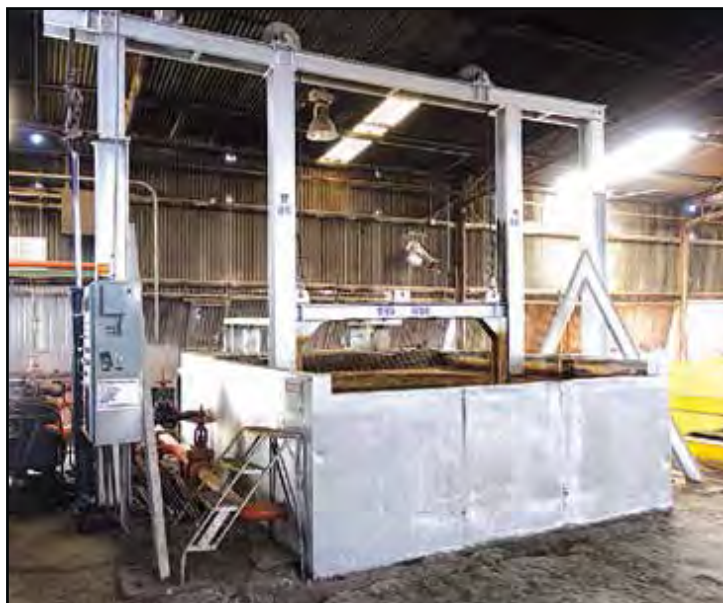
Polymer Quench System