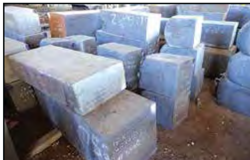
Raw Material Inventory