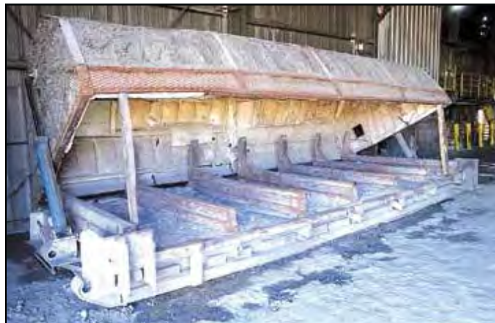
Forge Cooling Bed