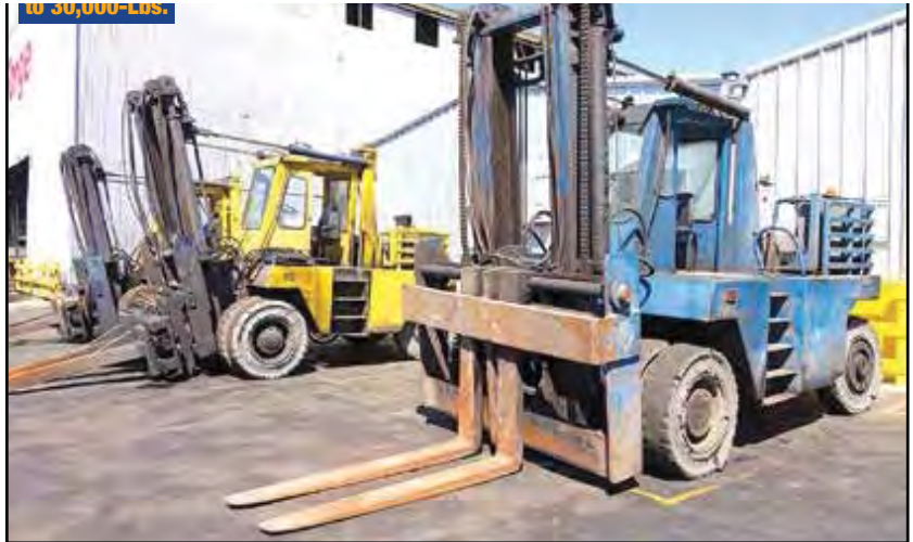
OTEK Forklift Trucks