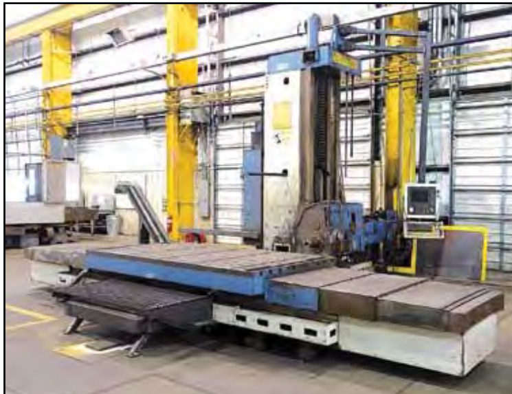
Giddings & Lewis 6" CNC Horizontal Boring Mill