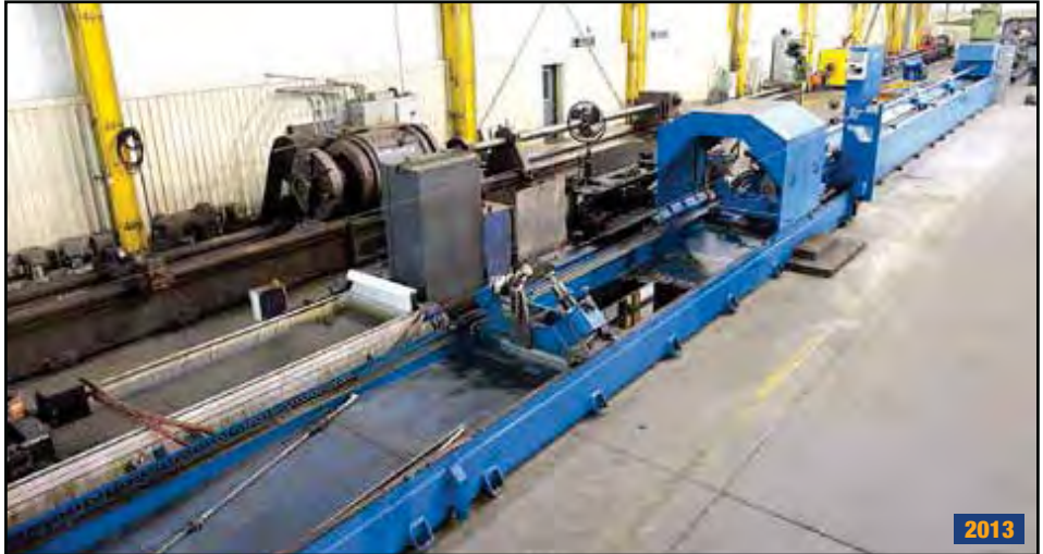
Barnes HH-12 46' Honing Machine