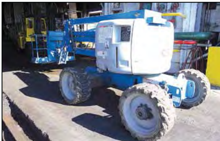
Genie Z45/25J Aerial Lift