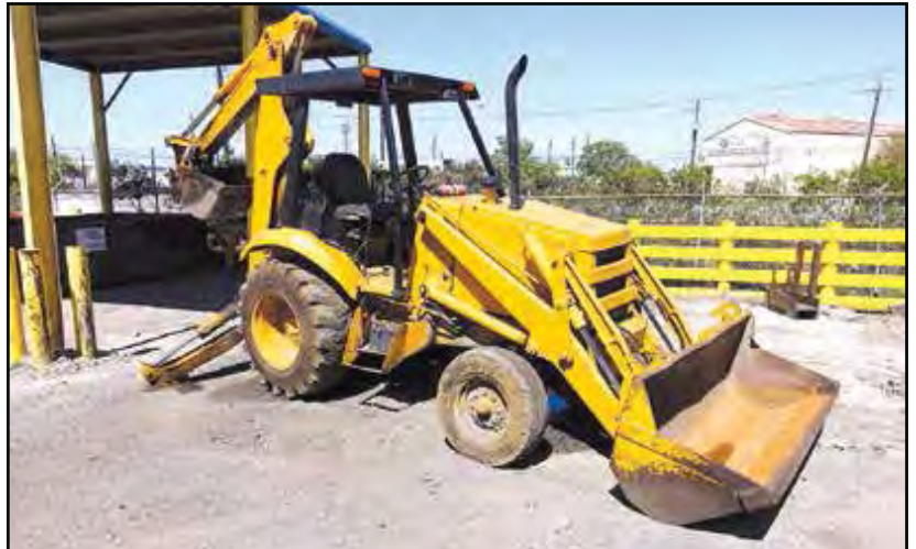
Case 580K Backhoe Loader

4 To schedule an auction, please call Hilco Industrial at 1-877-37-HILCO (44526)