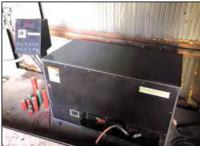
Magnaflux CD-2100 Current Generator