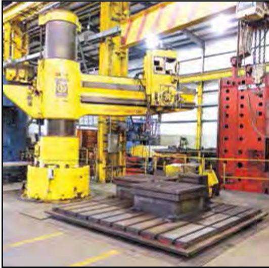
G & L/Bickford 10' x 34" Radial Arm Drill