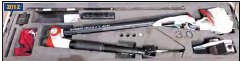
Romer RA-7530 Portable CMM