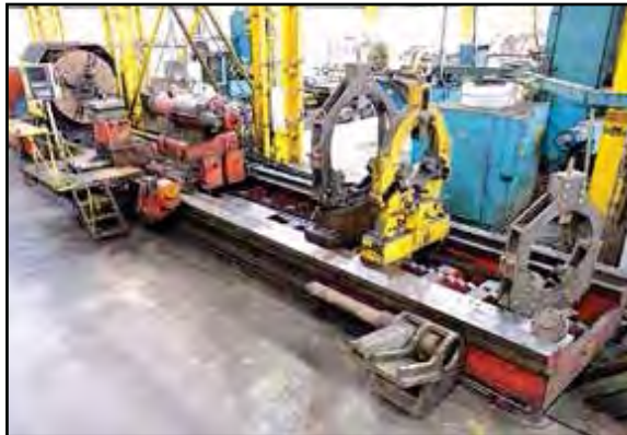
Betts 100" x 312" Heavy-Duty CNC Lathe