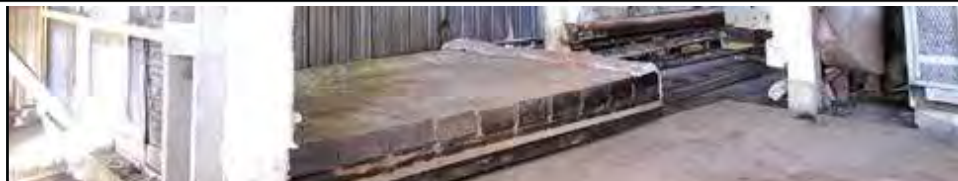
Car Bottom Furnaces