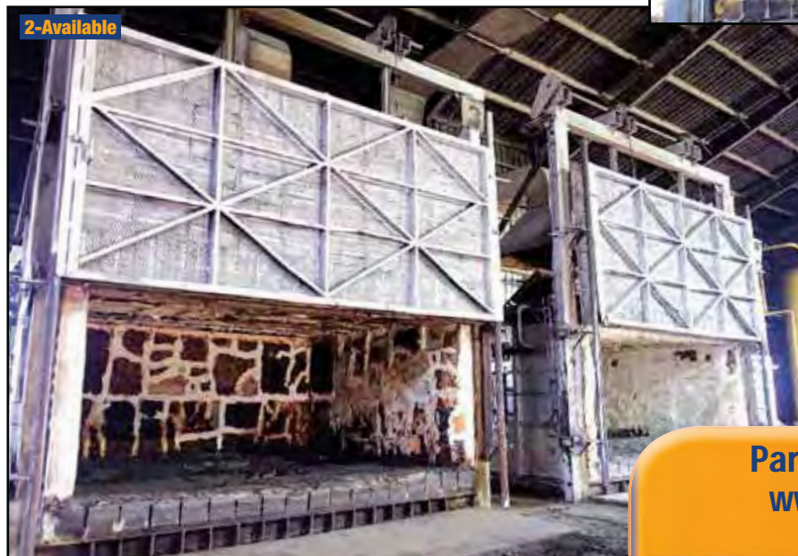
Energy Services Corp. Forge Furnaces