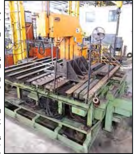
Kasto 48" x 60" Vertical Plate Saw