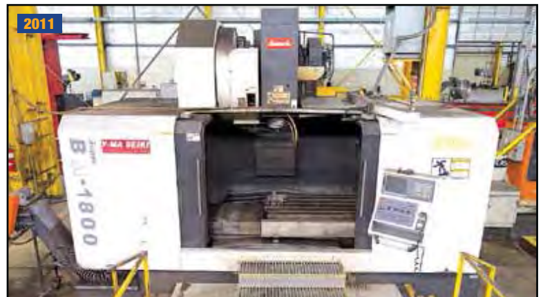
Yama Seiki BM-1800 CNC Vertical Machining Center