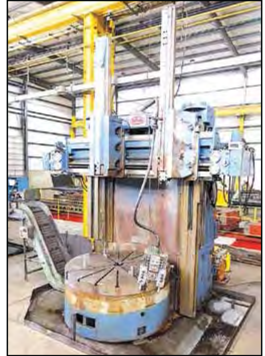
Bullard 76" Vertical Turning Lathe