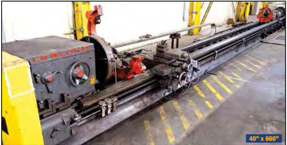
LeBlond 40" x 660" Heavy-Duty Lathe