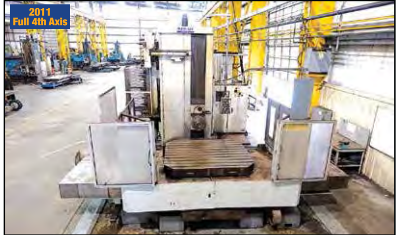
Hyundai-Kia KBN-135 CNC Horizontal Boring Mill