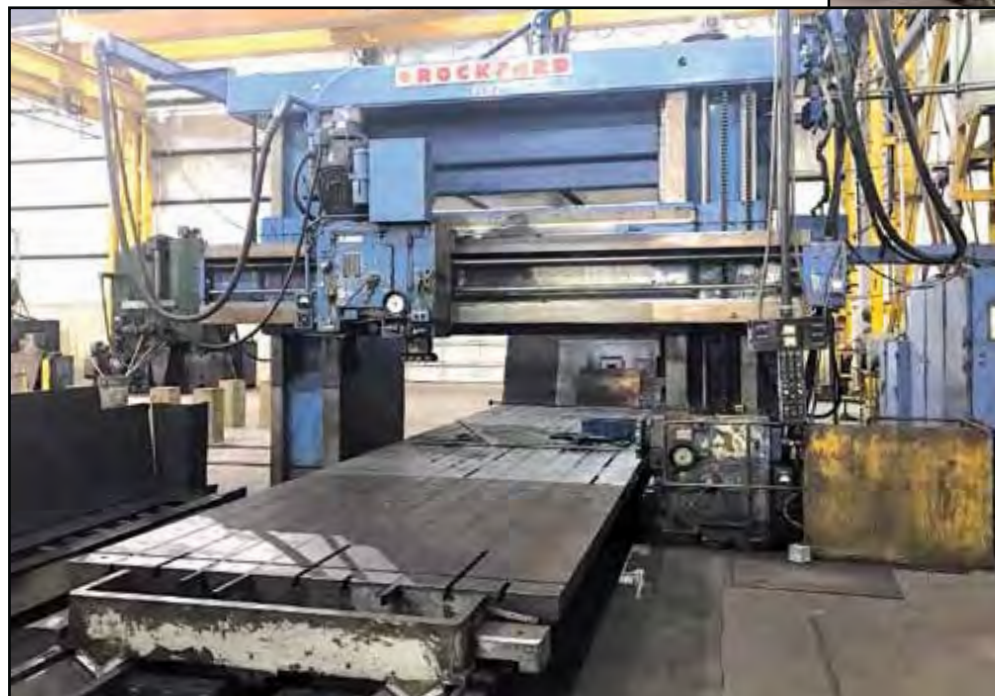
Rockford 96" x 72" x 360" Planer Mill