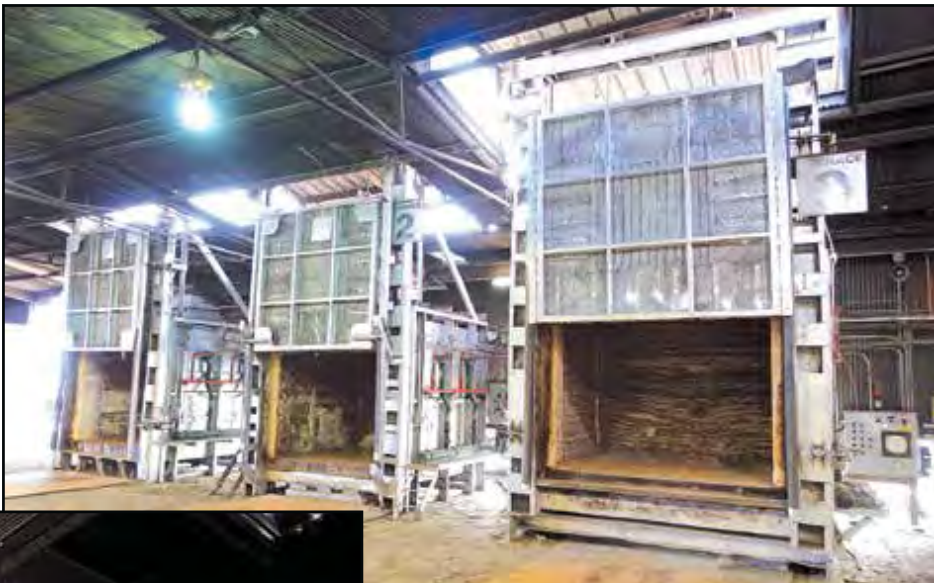
Energy Services Corp. Heat Treat Furnaces