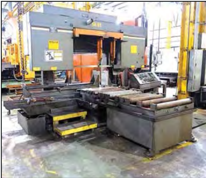
HEM 32" x 36" Horizontal Band Saw