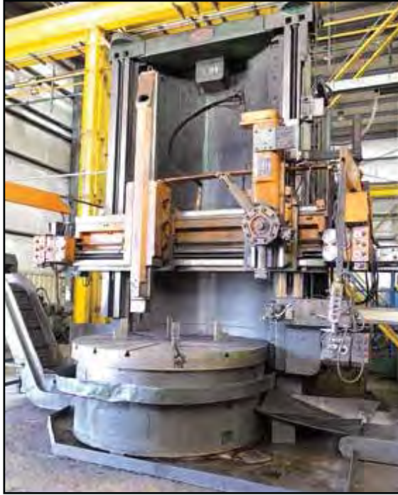
Bullard 86" Vertical Turret Lathe