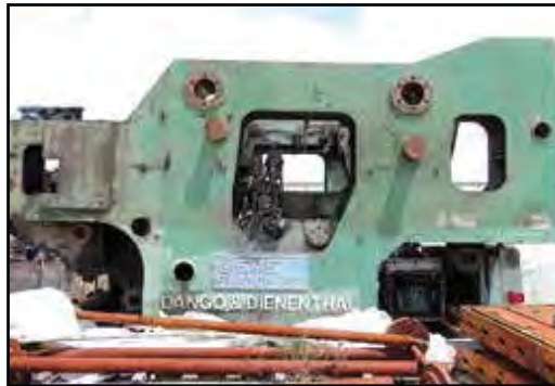
SMS Sutton/Dango & Dienenthal Forging Manipulator