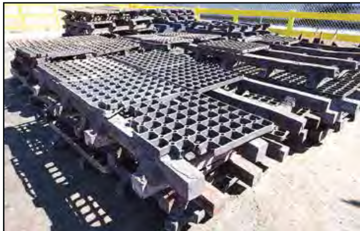
Inconel Furnace Liners