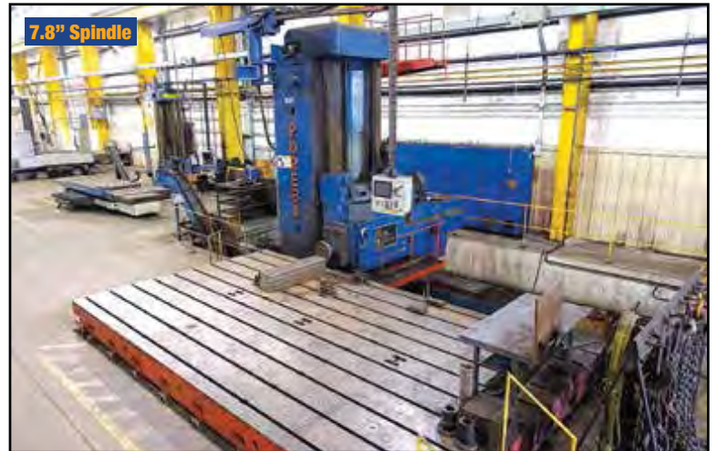
Poreba WFA-200 CNC Horizontal Boring Mill