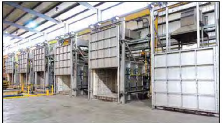
BROOKSHIRE, TEXAS, USA