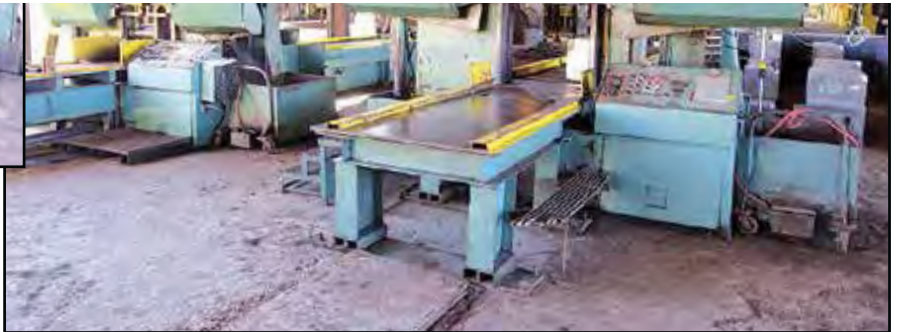
Hyd-Mech Horizontal Band Saws