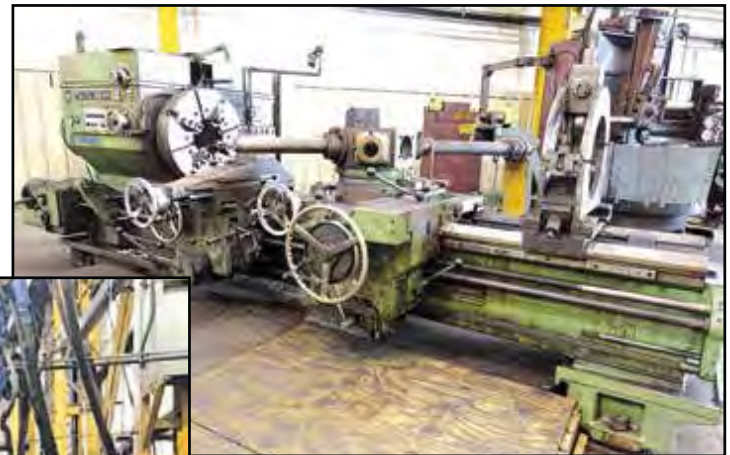
Taiyo Seiki Saddle-Type Turret Lathe