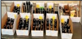
KURT Vises, 50 Taper Tool Holders, 40 Taper Tool Holders, Dividing Heads, Carbide Drills, Endmills, Turning Tools Drills and Sleeves.