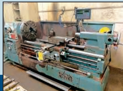
2006 KINGSTON HD2260 Engine Lathe , 20" swing over bed, 12" swing over cross slide, 60" centers, 3- and 4-jaw chucks, steadyrest, taper attachment, tool holders, DRO.

INSPECTION: Wednesday, October 31 from 9:00 A.M. to 3:00 P.M.