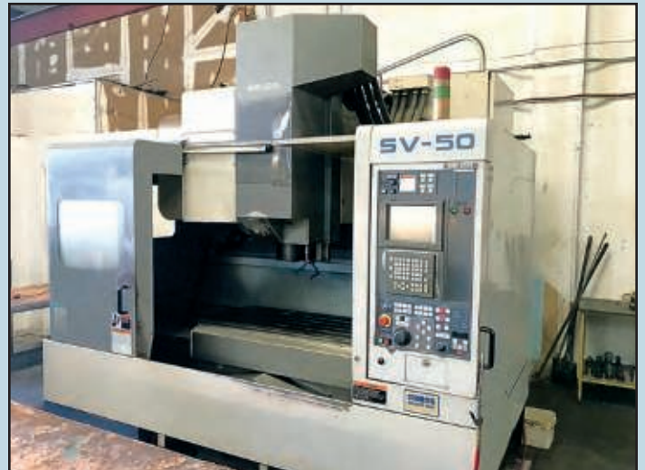
1997 MORI SEIKI SV-50/40 CNC Machining Center , 40" travels, 20-position ATC, Cat 40 taper, MSC-516 control, chiller auger, conveyors.