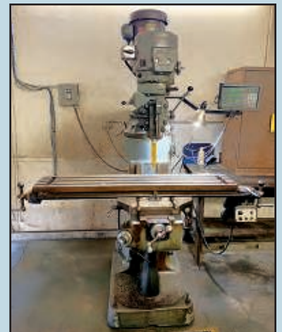
BRIDGEPORT Series II Mill , 9" x 49", power feed, 3-Axis DRO.