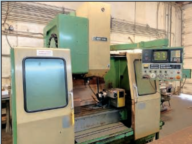
1987 MORI SEIKI MV-40/40 CNC Machining Center , 30" travels, 20-position ATC, Cat 40 taper, Fanuc 10M control, 4th axis