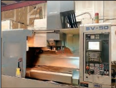
MORI SEIKI SV-50/40 CNC Machining Center .