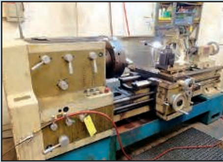
TARNOW Toolmax 22" Engine Lathe , 3- and 4-jaw chuck, 60" centers, 22" swing over ways, 30" swing in gap, 16" swing over cross slide, steadyrest, tailstock, DRO.