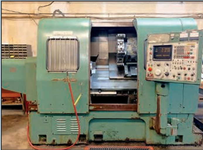
1987 MORI SEIKI SL-4A CNC Lathe , 11" 3-jaw chuck, 12-position turret, 20" swing x 22" centers, Fanuc 6T control, tailstock