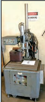
Tap Disintegrator Mdl. 2DBQT , 25 amp, power feed