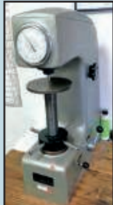
Hardness Tester .