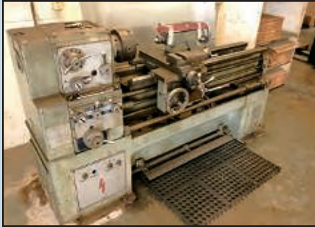
SHARPE 15" Engine Lathe , 3- and 4-jaw chuck, 12" swing, 48" centers, steadyrest, tailstock.