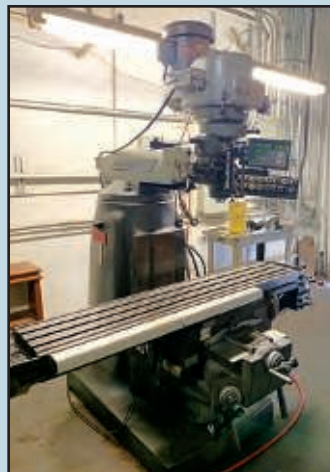
BRIDGEPORT Series II Special Mill , 10" x 54" power feed, 3-Axis DRO.