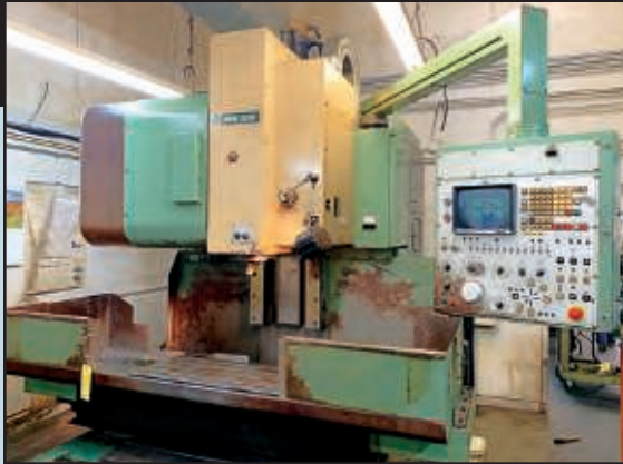
1982 MORI SEIKI MV-45/45 CNC Machining Center , 30" travels, 20-position ATC, Cat 45 taper, chip conveyor, Fanuc 6M control.

INSPECTION: Wednesday, October 31 from 9:00 A.M. to 3:00 P.M.