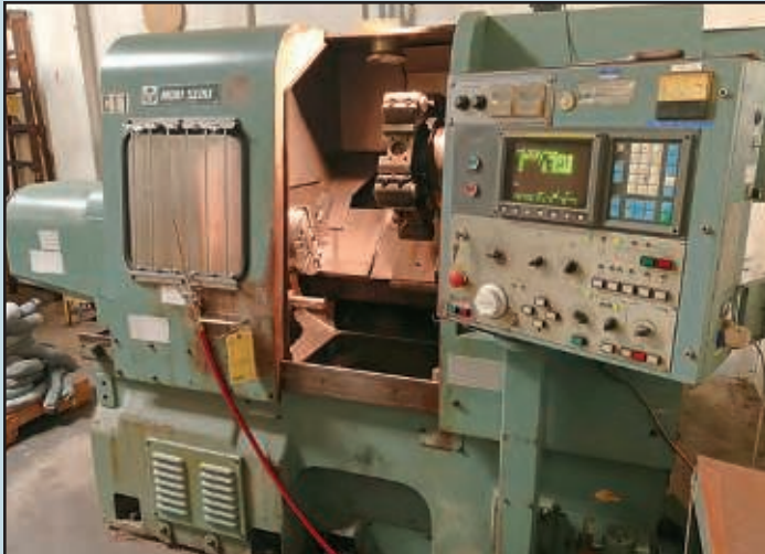
1986 MORI SEIKI SL-2HS CNC Lathe , 10" 3-jaw chuck, 12-position turret, high speed, retrofitted with Fanuc OT, no tailstock.