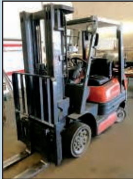
TOYOTA 5,000-Lb. Capacity Forklift , side shift, triple stage mast, cushion tires.