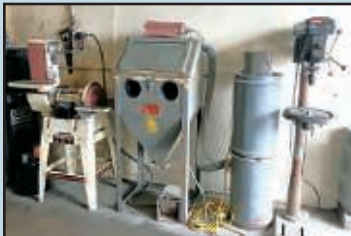
Shop Support .