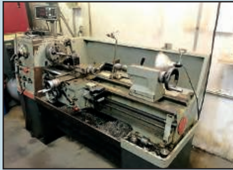
CLAUSING 13" Engine Lathe , 13" x 36", 8" 3-jaw chuck, taper, tooling, DRO.