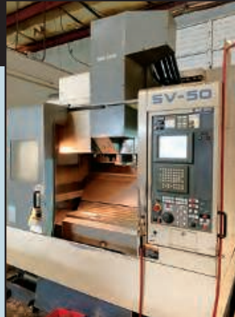
MORI SEIKI SV-50/40 CNC Machining Center , 30" travels, 30-position tool changer, CAT 40 taper, MSC-518 control, chiller, conveyors.