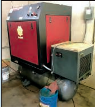
SHUREFLO Air Compressor , screw type, tank mounted.