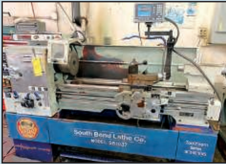
2010 SOUTHBEND 1640 Lathe , 15" variable speed, 3- and 4-jaw chucks, 48" centers, DRO, steadyrest, tailstock, tooling.