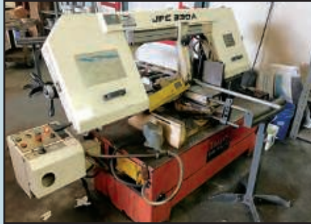
TRAJAN 13" Semi-Automatic Mitring Band Saw .