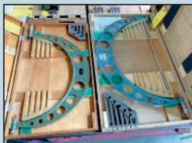
View of QC Equipment .