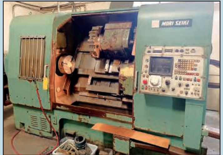
1982 MORI SEIKI SL-5 CNC Lathe , 15" 3-jaw chuck, 3-1/5" through spindle, 12-position turret, 16" swing x 42" centers, 40 HP, Fanuc 6T control, programmable tailstock, tooling.