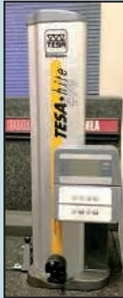
(2) TESA-HITE Height Gauges .